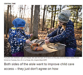
Wisconsin Public Radio