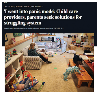
Wisconsin State Journal