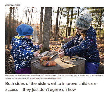
Wisconsin Public Radio